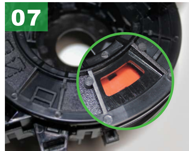
07 Align matchmarks and connect all cables.