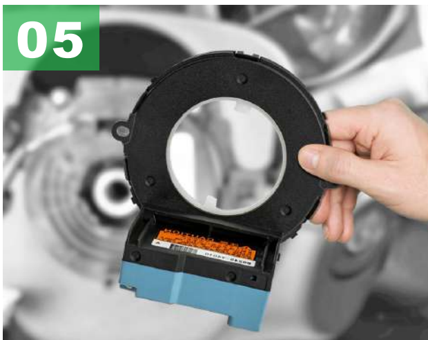
05 Move steering angle sensor (if any) to NEW clock spring.