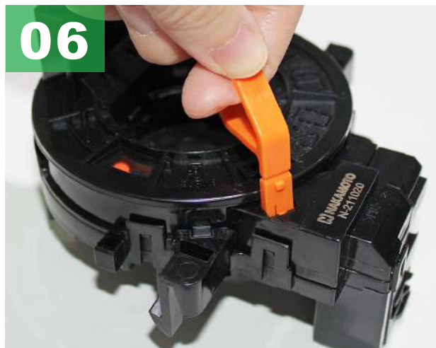
06 Remove lock pin before installation.