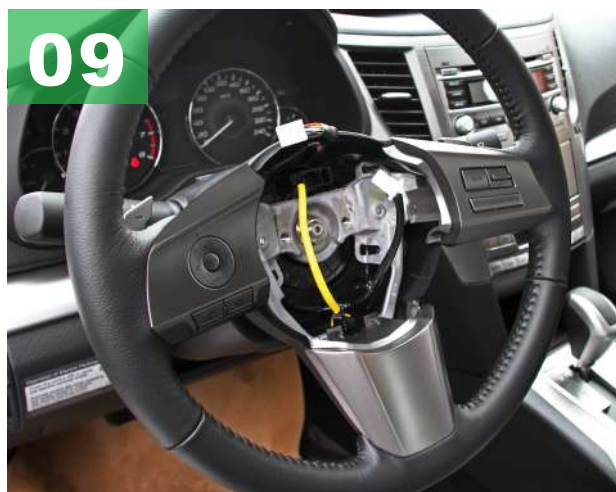
09 Reconnect airbag module and battery.